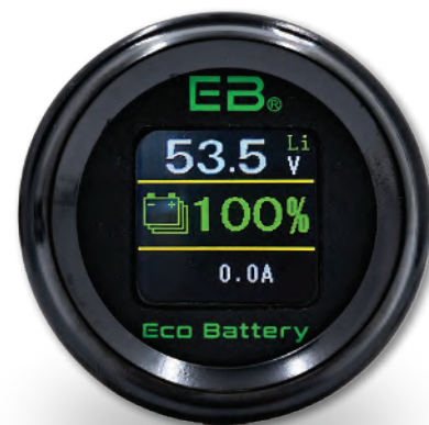
CAN LCD METER

If a trouble code appears on your meter, please record the trouble code and contact your dealer to discuss the code and, if necessary, take any actions required to correct it.